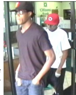
Philly Serial Bank Robbers—FBI