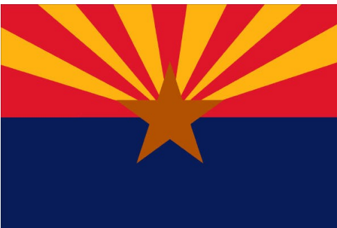
Arizona State Flag