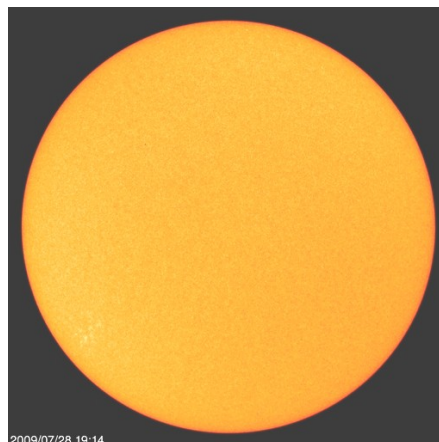
SOHO Sun Image 7/28/2009